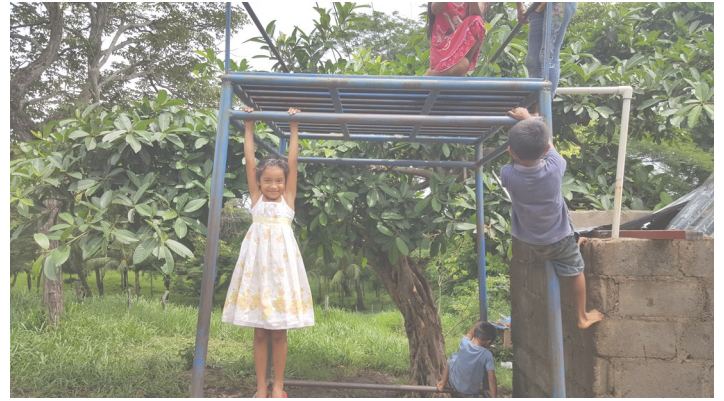
Forest Gym -Tank in Storage 2016