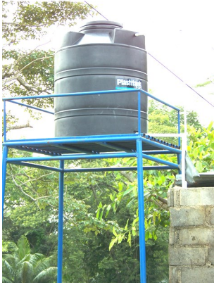
Water Tank Installed 2013

The purpose of The Mission Committee , in order to further share the gospel of Jesus Christ, is to responsibly use the resources of First Presbyterian Church of Newhall, wherever we find a neighbor in need. We are committed to meeting mission needs in our local community, across the nation, and globally, by sending money, food, clothing, volunteers, or whatever else is needed.